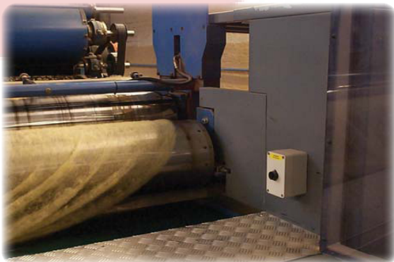
Limited Inch Control Station