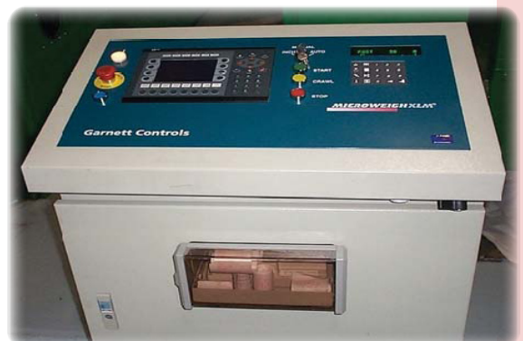
Typical Control Panel fitted with Limited Inch