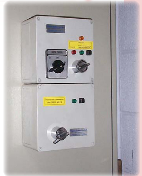
Single Key Interlock System to allow access through one guard only

The "Limited Inch Device" is operated by a hold to run 'Inch' button, a footswitch or two-handed controls. The actuator is on a pendant that is plugged into control stations located conveniently around the Card, so that the operator can see the Card in motion easily and safely. Being an International "Euro Norm" standard it applies equally to all machinery used in the rest of the EEC.